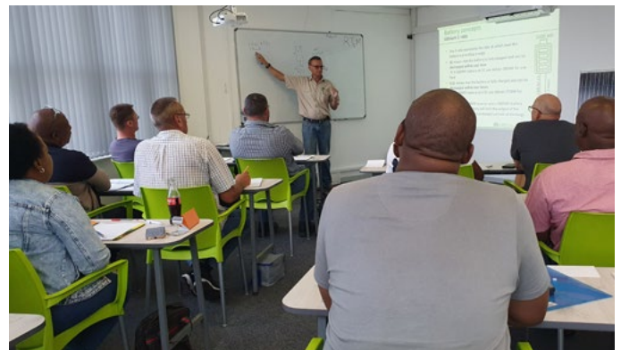
Join our course and meet fellow entrepreneurs